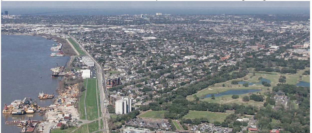
Drone photo of former Jefferson City at lower right and Carrollton City at center, which were annexed into New Orleans in 1870 and 1874, respectively.

Like most riverfront neighborhoods, Carrollton is traceable to an eighteenth-century French long-lot plantation which urbanized in the nineteenth century. But the area had two distinguishing characteristics.